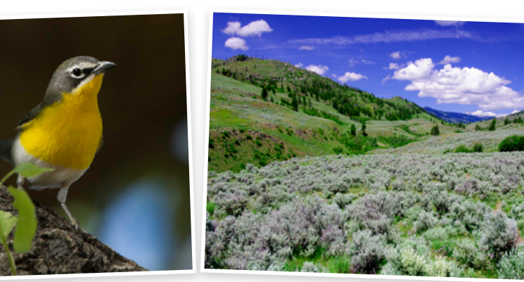
Photo top: near White Lake grasslands. Photos above: yellow-breasted chat, Kilpoola grasslands.

Safeguarding this precious region permanently must be a priority. To decrease threats and ensure permanent protection for this endangered landscape, the governments of B.C., Canada and the Okanagan Nation Alliance have agreed to work together to establish the South Okanagan-Similkameen National Park Reserve. Read on to find out more about this exciting opportunity.