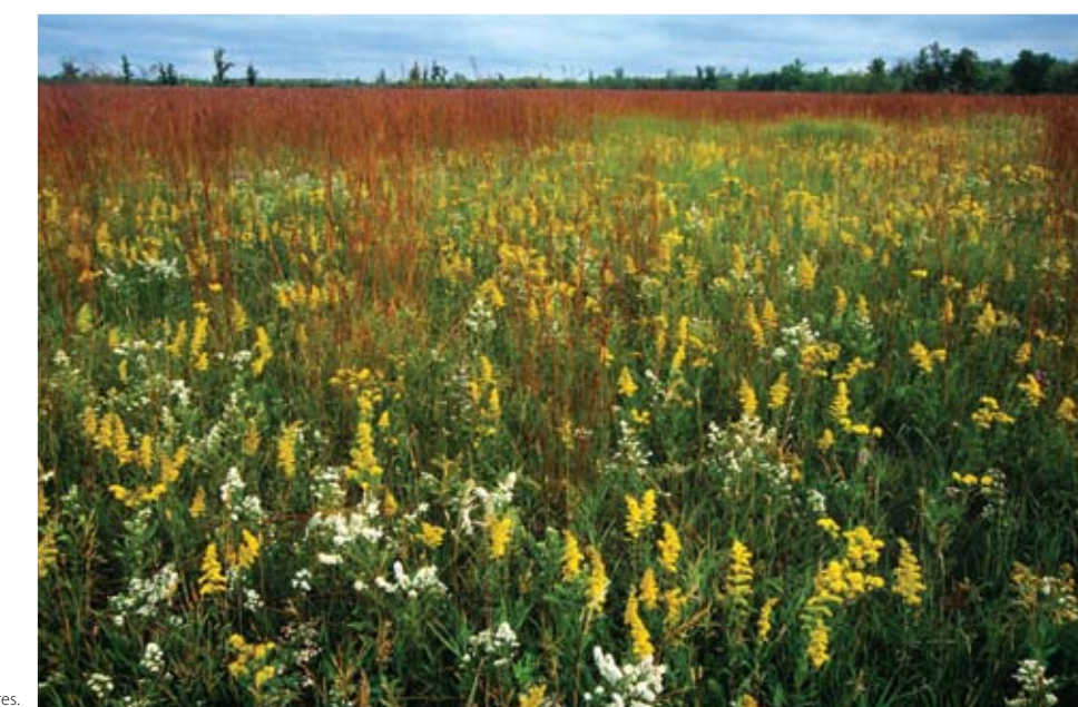
Tallgrass prairie between the Gardenton and Pansy Pastures.

The entire region faces similar threats—inappropriate fire regimes, water level management, and agricultural encroachment. Expanding the Tallgrass Prairie Preserve with the inclusion of the Gardenton and Pansy Pastures will offer a better chance to protect uncommon ecosystems and rare biodiversity.