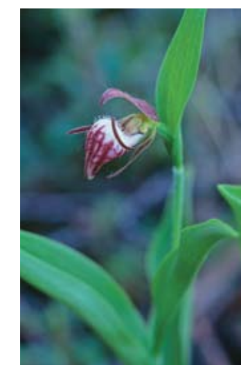
The Ram's-head Lady's-slipper (Mike Grandmaison), a rare orchid, has been found in the Whitemouth River area.

Some threats to the Whitemouth River include agricultural encroachment and run-off, as well as water drainage plans that could cause siltation. Peat mining operations have started in the area, and could impact the waterway. In the spring of 2009, the Manitoba government protected a section of the Whitemouth River Bog close to where it drains into the Winnipeg River, and this is a welcome step. To maintain clear water flows in Manitoba, to preserve rare species, and to mitigate climate change, the upper section of the Whitemouth River and surrounding bog should be protected.