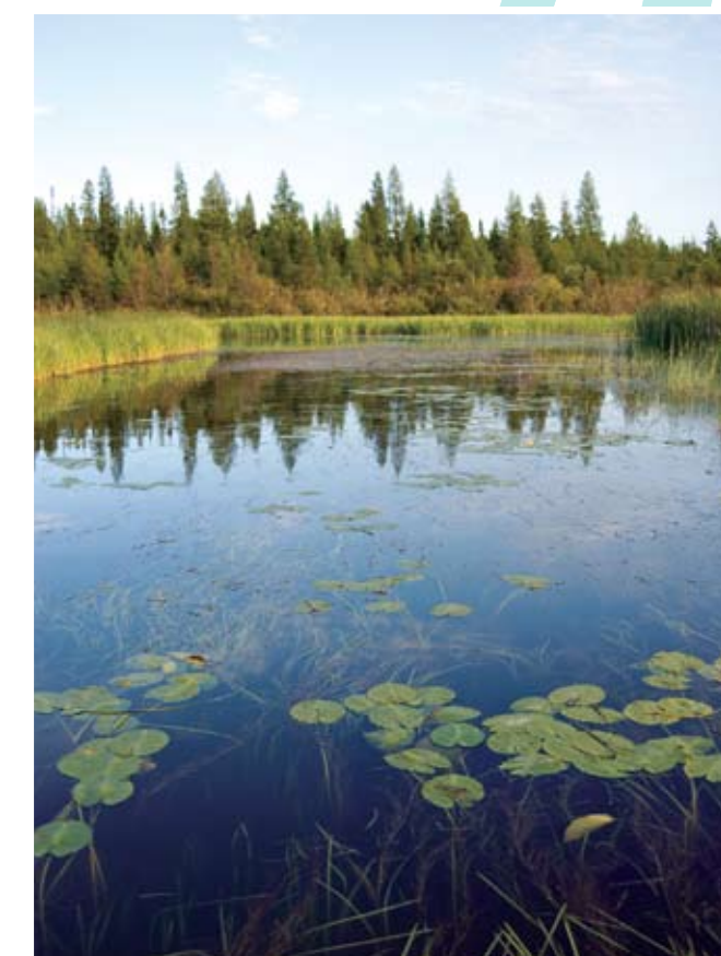
Meandering streams and lowland forests, like this one in the Interlake, can be found in the Chitek Lake Park Reserve (Eric Reder).

The current interim status on the Chitek Lake Park Reserve prohibits logging and mining in the area but protection expires in September 2009. Another five-year period of interim protection will provide time for further planning for this area.