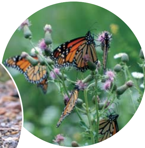
Western prairie orchid, Short-eared owl, Monarch butterflies, Woodland caribou, Wood bison.