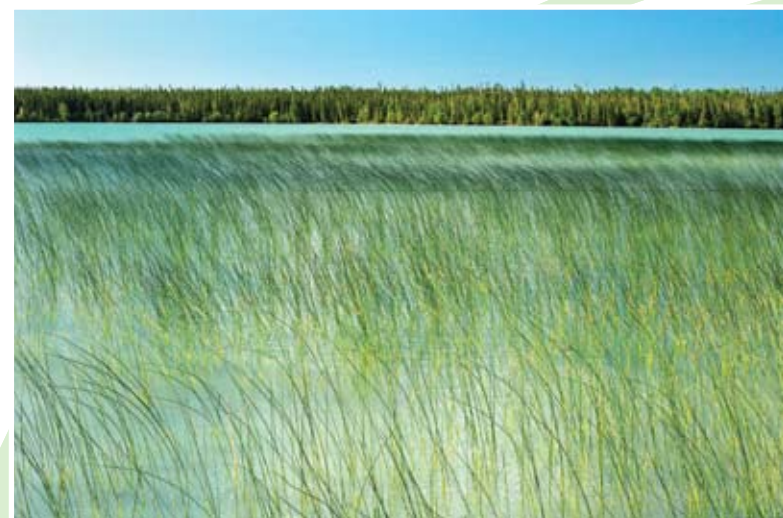
Clearwater Lake (Mike Grandmaison) is on the northern edge of the Tom Lamb Wildlife Management Area, part of the lower Saskatchewan River Delta.

Straddling the Manitoba-Saskatchewan border near The Pas is one of the largest freshwater deltas on earth. The Saskatchewan River Delta (SRD) is a collection of lowland grass plains and bogs, with lazy streams meandering between black spruce-tamarack forests and ridges covered in white pine, aspen and birch. The SRD is both