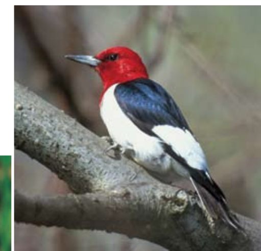
Red-headed woodpeckers (Robert McCaw), a threatened species, make their home in the Fish Lake area, where you can also find the Showy Lady's-slipper (Mike Grandmaison).

Currently there is no protection for the Fish Lake fen, although there is local interest in protecting the area. The biggest threats to the area are waterflow control, conversion of the land to agricultural usage and mining. As with other peatlands, the Fish Lake area is a carbon sink, making protection of this area an important step to mitigate climate change.