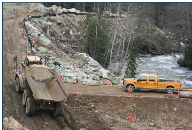
Fire Creek being "prepared" for river diversion.

The impacts from a private river diversion project are long lasting, and include permanent loss of fish and wild life.