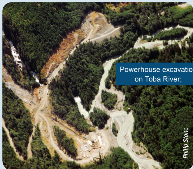
Powerhouse excavation on Toba River;