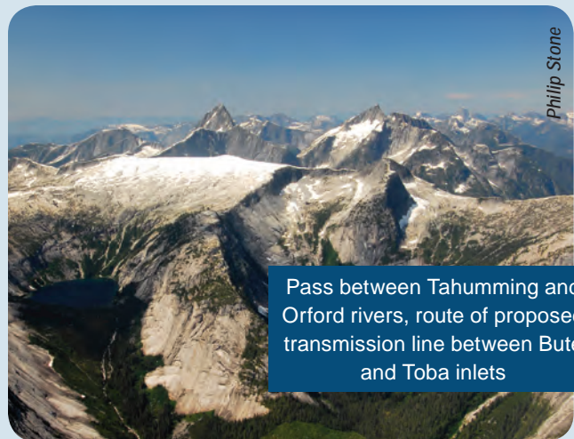
Pass between Tahumming and Orford rivers, route of proposed transmission line between Bute and Toba inlets